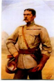
Maj-Gen. Sir H.H. Kitchener